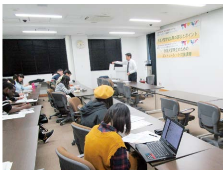
Entry Sheet Preparation