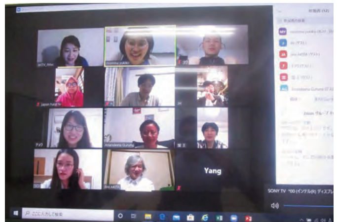
Alumni exchange event (2020)

■ For details please see the DATEntre website.