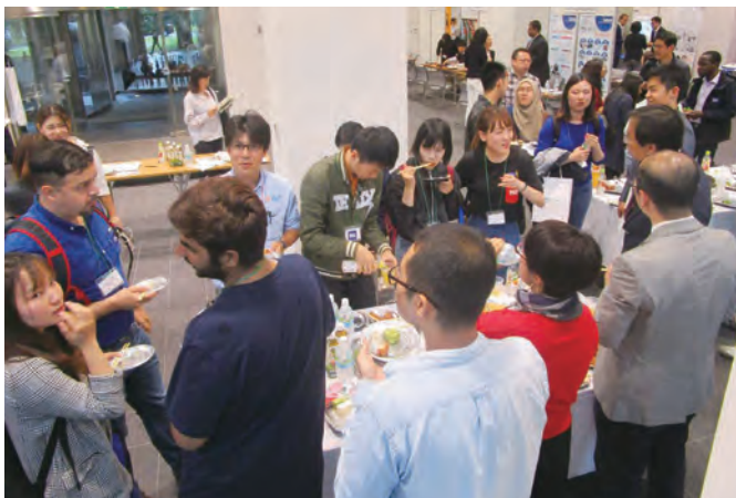
JETRO/Exchange event for international students and foreign-investment companies (2019)

The curriculum mainly comprises classes from the Tohoku University Japanese Language Program at Kawauchi and General Education curricula. It helps students to acquire the Japanese communication skills and understanding of corporate culture required to work in Japan. In consultation with the instructors, students can determine a course schedule that does not conflict with their research and meets their needs. In addition, the extracurricular seminars enable students to prepare for job-hunting activities in an organized manner. Please join DATEntre and turn your dreams of working in Japan into a reality! Participation on an as-needed basis is also possible. Please inquire if you are interested.