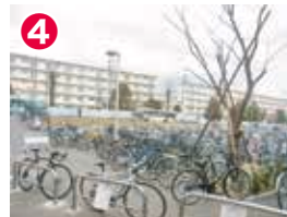
DO NOT park bicycles at campus entrances/exits. If there are no places to park, look for a place at another parking area.