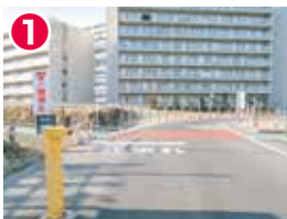
Intersection with footpath. You must stop at this intersection.

Take particular care to avoid hitting pedestrians and cyclists at the five locations shown below.