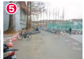
DO NOT park bicycles in front of the gymnasium entrance, as it hinders access to the building.

Use one of the designated parking areas. Do not park on roads as it hinders traffic.