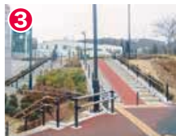
When moving between the road and parking area, cyclists must dismount and push their bicycles up the slope in the middle of the stairs. When descending too, cyclists must dismount.