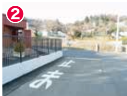
Area in front of the pre-school. Be extra careful of children in this area.