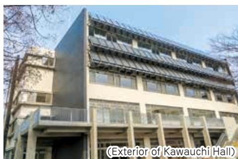
(Exterior of Kawauchi Hall)