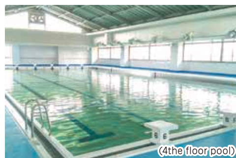
(4th floor pool)

1F Practice rooms/ mini-theater for cultural activities