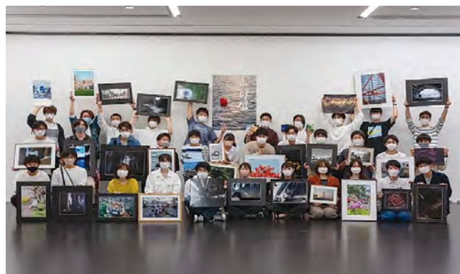
▲A sample of the Photography Club's skill!

Photography lets you preserve your precious years of university life as pictures, or share your perspective of the world with others. There are various ways to enjoy it. The next photo exhibition will be at the end of October. Please come and catch a glimpse of our vision of the world.