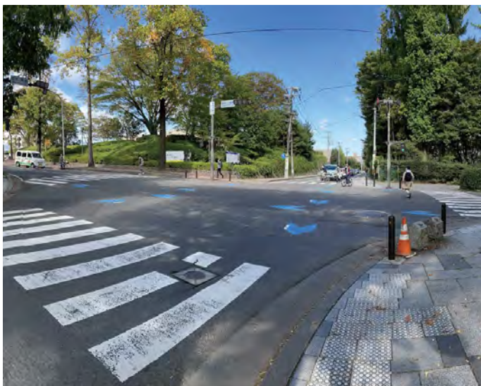
▲Intersection in front of Sendai Daini High School

This means that vehicle traffic is stopped in all directions to allow pedestrians to cross. However, crossing it diagonally is not permitted. Cyclists should dismount their bicycles when crossing with pedestrians. Please be aware that your public actions reflect on the Tohoku University community as a whole —observe traffic rules, and commute safely!