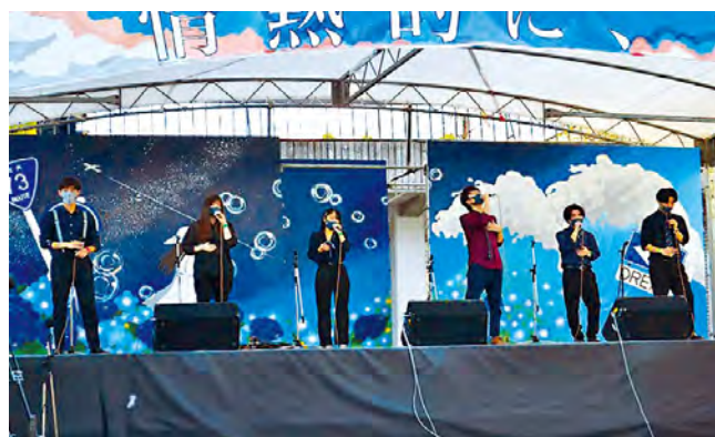
▲The A Capella Chorus Club in action!

As for year-round events, the club holds live performances 2 or 3 times a year, with most bands giving performances at school events. Bands that pass an audition perform at periodically held concerts and/or the Winter Live event. Many bands also set their sights on performing at off-campus events or competitions, so members can participate in a wide range of activities whether they want to simply enjoy singing or wish to dedicate themselves to it and improve.