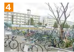
4 DO NOT park bicycles at campus entrances/exits. If there are no places to park, look for a place at another parking area.