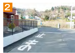
2 Area in front of the pre-school. Be extra careful of children in this area.