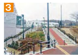
3 When moving between the road and parking area, cyclists must dismount and push their bicycles up the slope in the middle of the stairs. When descending too, cyclists must dismount.