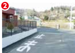
2 Area in front of the pre-school. Be extra careful of children in this area.