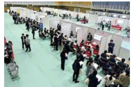
Fall Open Company

The main events planned for AY 2026 are the Summer Open Company (May), Fall Open Company (October), and Fall Online Open Company (November).