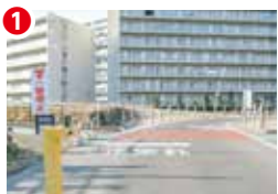
1 Intersection with footpath. You must stop at this intersection.

Take care when traveling through the five zones shown here as the danger of collisions with pedestrians or vehicles is particularly high.