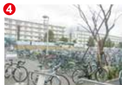
4 DO NOT park bicycles at campus entrances/exits. If there are no places to park, look for a place at another parking area.