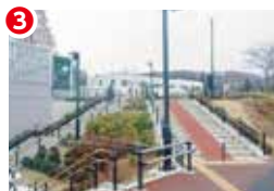
3 When moving between the road and parking area, cyclists must dismount and push their bicycles up the slope in the middle of the stairs. When descending too, cyclists must dismount.