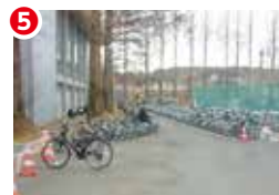
5 DO NOT park bicycles in front of the gymnasium entrance, as it hinders access to the building.